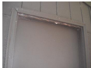
Dry Rotted Garage Door Lintel 118BB