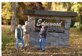
New Sign Installation